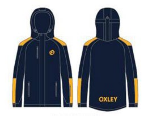
New waterproof Snowsports jacket

Oxley beanie: The Oxley Snowsports beanie or Oxley beanie is available for purchase at the uniform shop and is to be worn at medal presentations along with an Oxley Snowsports Jacket.