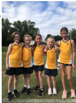
IPSHA Cross Country