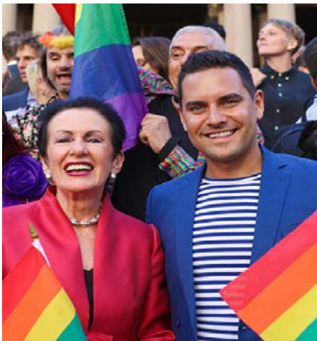
MP Alex Greenwich, pictured here with Lord Mayor of Sydney Clover Moore at a Pride event

Alex Greenwich is the successful independent candidate for the seat of Sydney, which he has safely held since 2012, and his support in passing state laws in the future is entirely conditional on the plans each party have to pass this ban. To give a brief rundown on the functioning of NSW Parliament, the passing of laws functions in mostly the same way as federal laws. The law passes through two houses which can only happen if the law gets a majority vote in both. This essentially provides independent candidates, with no affiliation with any parties, the opportunity to make big asks from major parties and control some of the goings-on within state law. In exchange, major parties ask for their votes on laws that they want to pass.