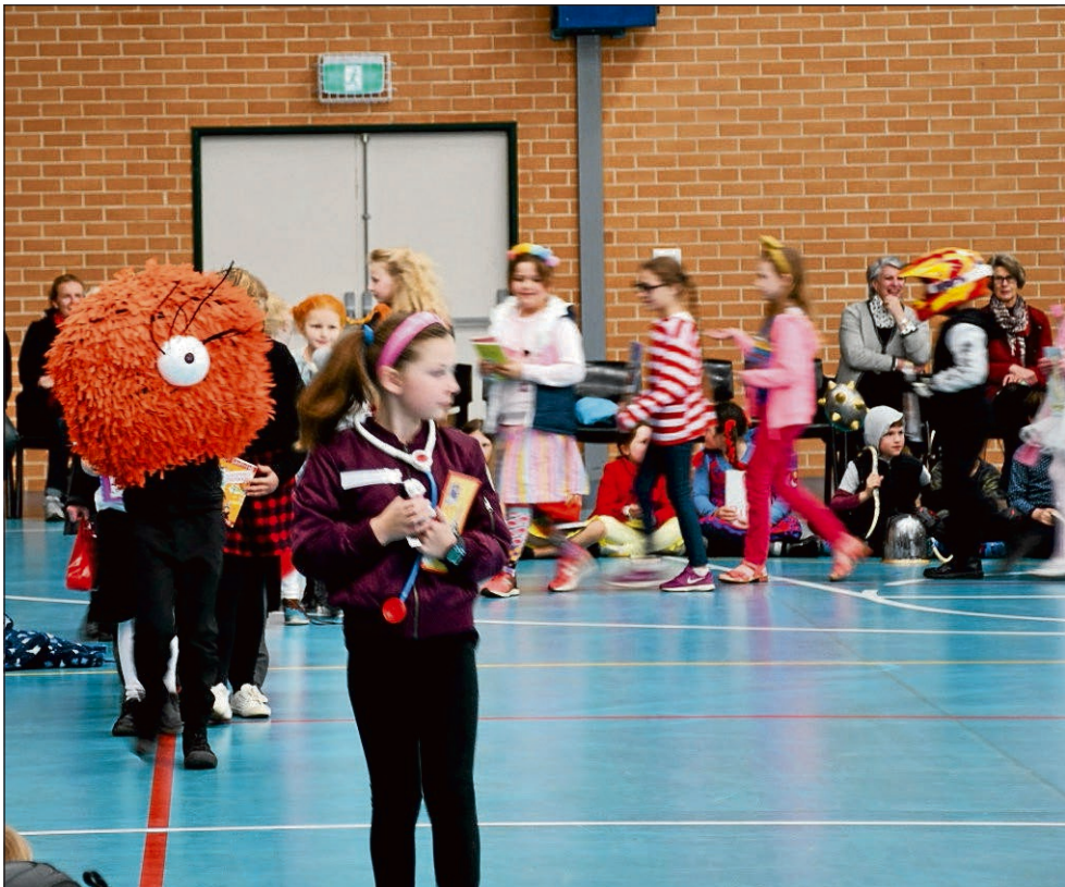
READING: Oxley students participated in a parade for Book Week.