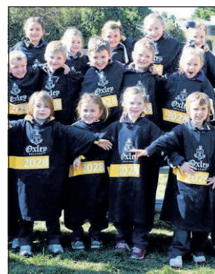
Oxley Kindergarten 2016