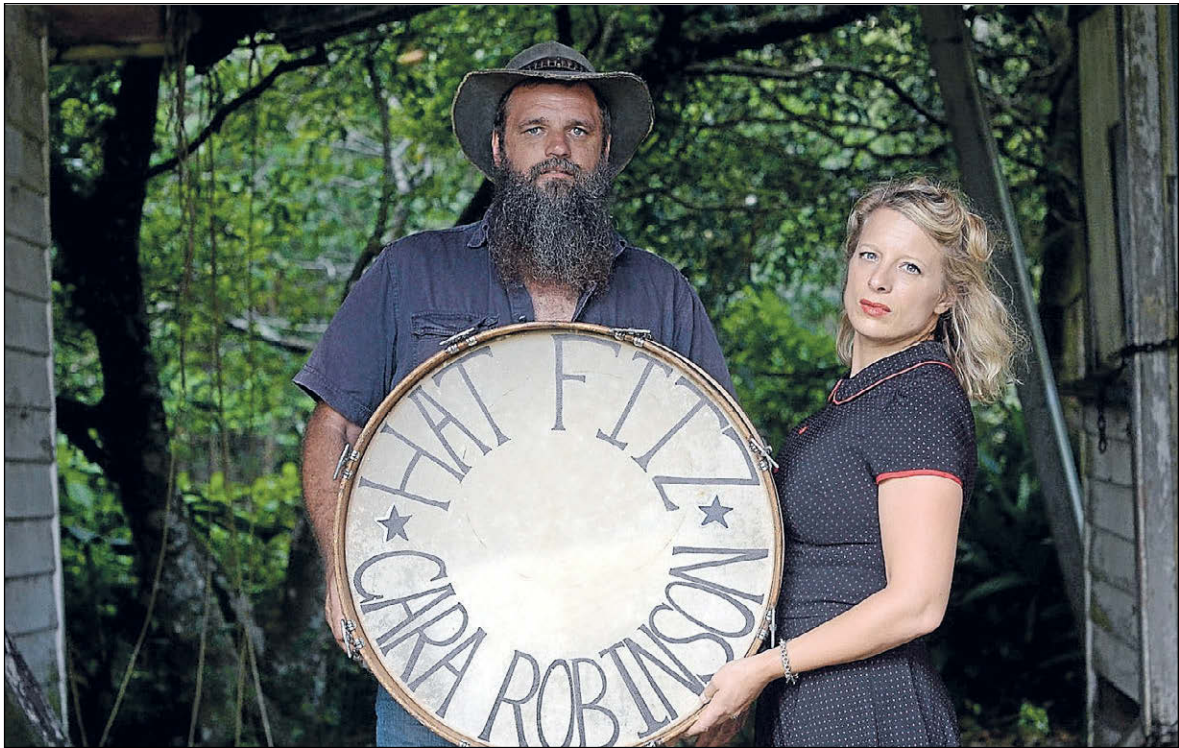
Hatz Fitz and Cara will perform in Bowral next week.