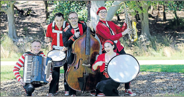
Lah-Lah will kick off its tour in the Southern Highlands.